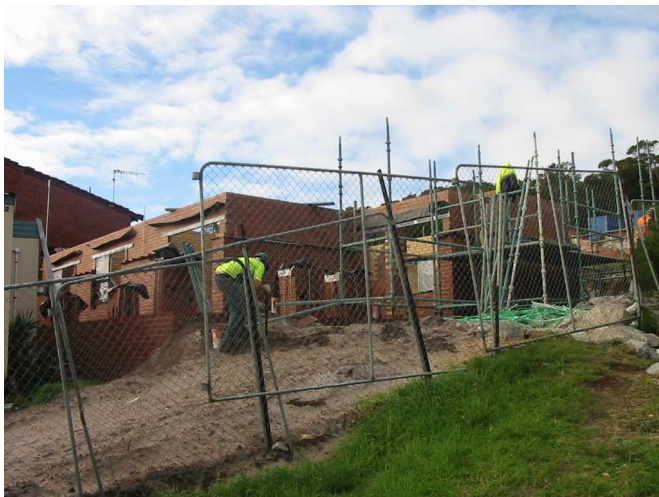
Construction begins on the staff quarters at the rear of the College.